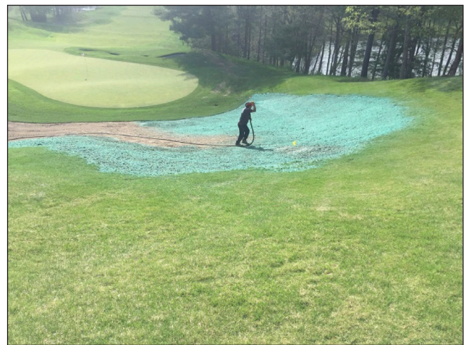
Figure 4. Hydroseeding.

The loss of topsoil from a site can be a problem for numerous reasons. Soil carried by wind and water transports contaminants with it. For example, erosion can enrich surface waters, where phosphorus and, to a lesser extent, nitrogen can cause eutrophication. When sediments and soils enter water, they can also increase turbidity, which harms aquatic plants and animals. Therefore, control measures should be documented in an erosion and sediment control plan, put in place prior to any soil disturbance, and properly maintained.