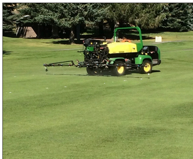
Figure 15. Foam markers help with spray accuracy.

Superintendents should consider the use of GPS-guided sprayer systems (Figure 15). With individual nozzle control, auto steering, automatic pressure adjusting, auto boom height, these systems have been shown to significantly improve accuracy and consistency of targeted pesticide applications, reduce chemical and labor costs, and, by reducing overall chemical use, improve environmental stewardship efforts.