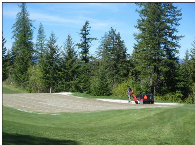
Figure 11. Hollow-tine aerification of a green.