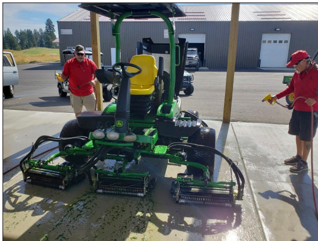
Figure 18. Proper equipment washing technique protects water quality.

A primary concern when washing mowing equipment is the nitrogen and phosphorus nutrients in grass clippings. Using compressed air to blow clippings off mowers before washing can help reduce the amount of nutrients that enter drains via washwater. The best practice is to have a dedicated wash area with a catch basin to collect remaining grass clippings. Clippings can be collected, then composted or removed to a designated debris area. When formal washing areas are not available, a “dog leash” system using a short, portable hose to wash off the grass at random locations, away from surface waters, wells, or storm drains, is an option.