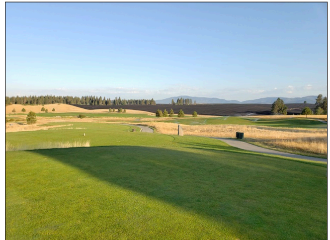
Figure 14. Prescribed burns, like the one in the background, help control undesirable plants.

bans may be more restrictive but not less than what is identified in the state proclamation for the same area.