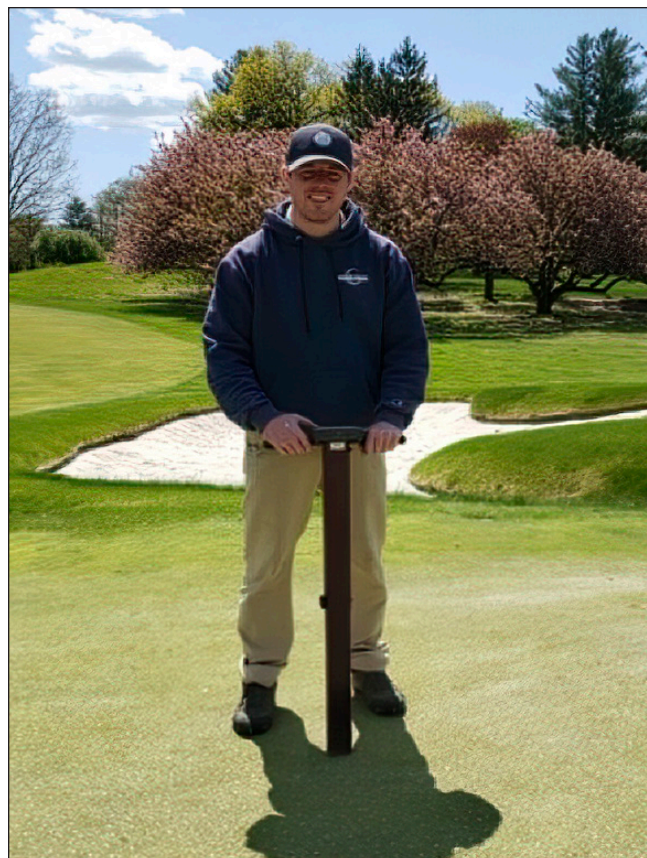
Figure 6: Soil moisture sensors help facilitate irrigation management decision making.

Rain gauges, rain shut-off devices, soil moisture sensors, and other irrigation management devices accurately measure local precipitation and should be incorporated into irrigation management decision-making (Figure 6). Soil moisture monitoring, in addition to calculating ET rates and visually observing turfgrass, assists in planning irrigation to meet turfgrass water needs while conserving water resources.