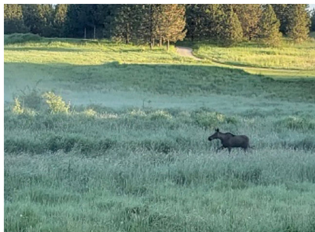
Figure 2: A well-planned golf course enhances wildlife habitat

The “Pollinator Protection” and “Landscape” chapters provide additional recommendations and BMPs for enhancing habitat on the golf course.