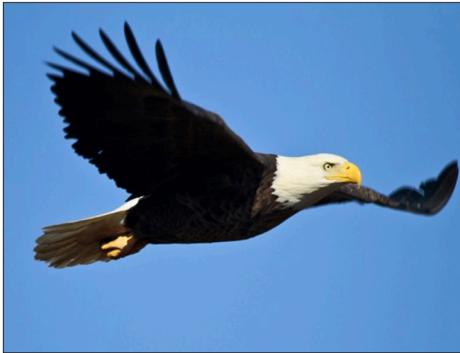
Figure 1: The bald eagle is one protected species that can be found in Idaho.

The Idaho Governor’s Office of Species Conservation (OSC) plans, coordinates, and implements the state’s actions to preserve, protect, and restore species in Idaho listed as candidate, threatened, or endangered under the federal Endangered Species Act. OSC publishes the listed species found in Idaho.