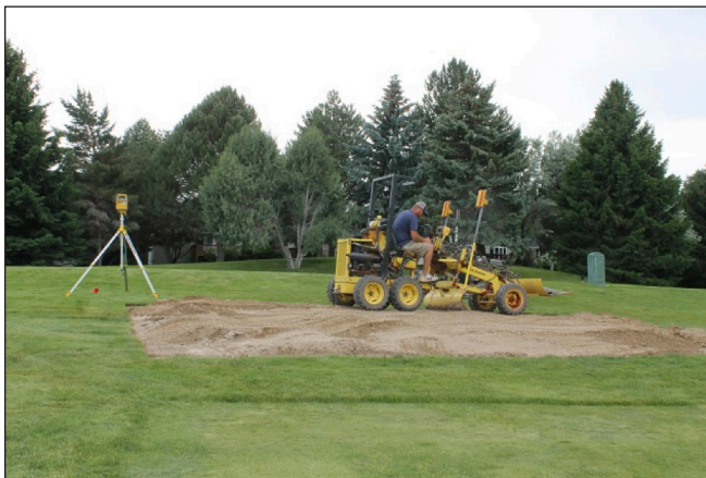
Figure 3: Grading the surface prior to planting.

Debris should be removed that could hinder root growth and limit access to water and nutrients. Any drainage issues should be corrected through grading and installation of drainage technologies. Pre-plant amendments should be added per soil test recommendations. Additional information on steps for successful establishment of turfgrass that also applies to golf course turfgrass establishment can be found on the Site Preparation for Lawns and Turf web page of the University of Idaho Extension website.