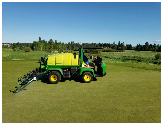
Figure 16. Due to their accuracy and efficiency, GPS sprayers represent a “Best” management practice.