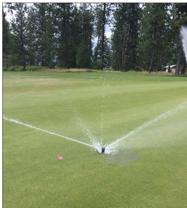
Figure 5: Regular auditing of the irrigation system should be performed to check actual water delivery and nozzle efficiency.

While routine inspection and audits can be performed by the golf course superintendent, a professional irrigation consultant is required for a detailed irrigation audit, which should be conducted according to the Irrigation Audit Guidelines published by the Irrigation Association. Ideally, this professional audit should be conducted at least once every five years.