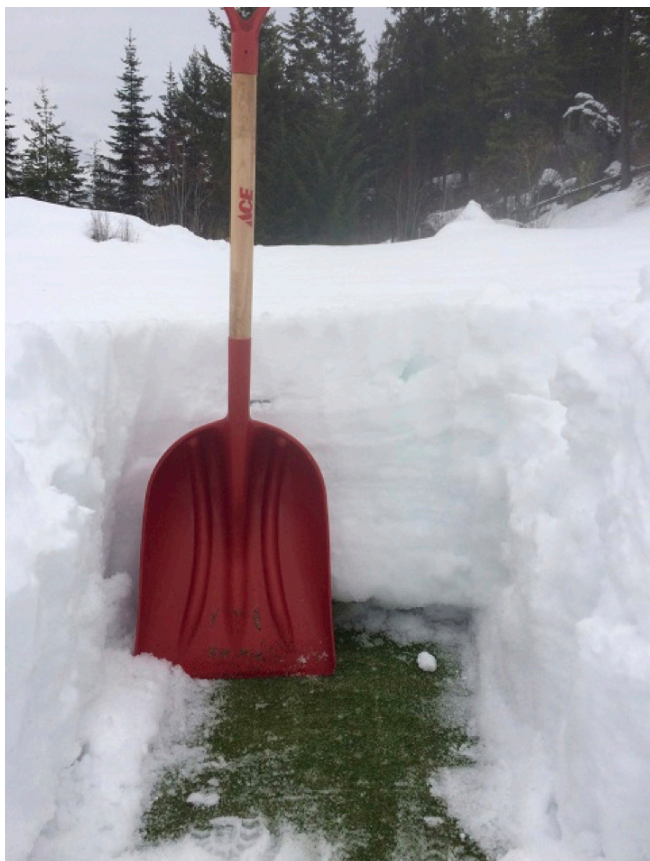
Figure 13. In some cases, superintendents may choose to remove accumulated snow from a green.

Measures for preparing turfgrass for dormancy include appropriate nutrient management planning, sand topdressing, pesticide applications to prevent snow mold, and covering the turfgrass surface. For example, turfgrass should not be overfertilized with N in the fall; PGRs should not be used too close to the time of dormancy; and field capacity should be reached before installing covers. The use of antidessicants, permeable or impermeable covers, wood mulch, straw, etc. can help to prevent or minimize winterkill.