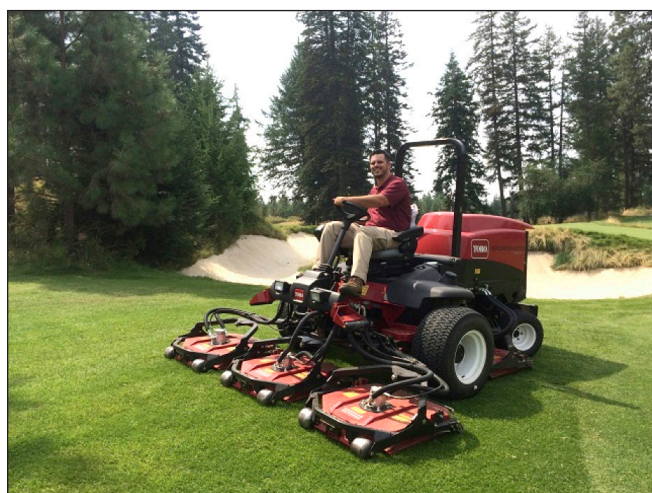
Figure 10. Rotary mower.

Maintaining blades by sharpening and adjusting them regularly provides the best quality cut. Dull blades shred leaf tissue, increase water loss, and increase the potential for disease development.