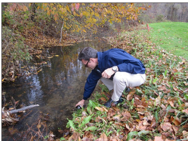
Figure 8: Drawing a water sample.

Developing a water quality monitoring program on golf courses is often limited to surface water monitoring. Sampling of benthic macroinvertebrates in streams is a useful addition to a monitoring program, as species composition and diversity can be used as a relative assessment tool for stream health. For more information on sampling, see New Mexico State University's Stream Biomonitoring Using Benthic Macroinvertebrates . Such sampling can often be undertaken by university students in fulfillment of course work, by watershed association volunteer groups, or by other volunteer monitoring efforts.