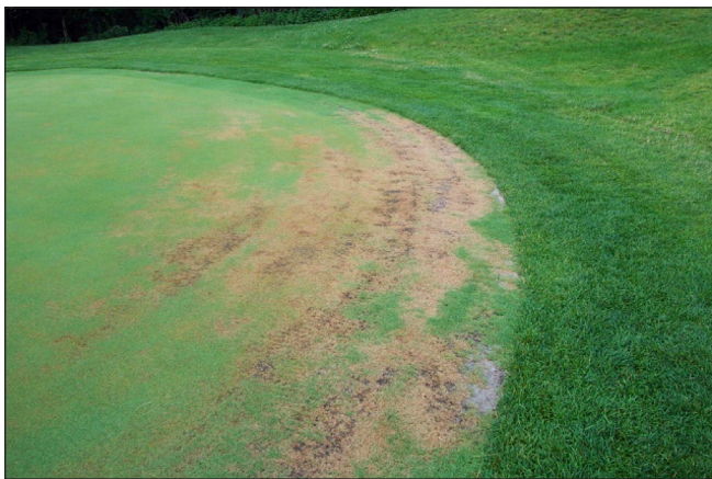
Figure 9. Mowing practices can cause injury to turf.

Mowing is the most commonly used cultural practice on golf courses. Mowing practices impact turfgrass density, texture, color, root development, and wear tolerance. Failure to mow properly results in weakened turfgrass with poor density and quality (Figure 9). Mowing height, frequency, equipment, time of year, abiotic and biotic stress, root growth, and shade can all affect mowing quality. As much as possible, mowing should increase tillering and shoot density while not decreasing root and rhizome growth.