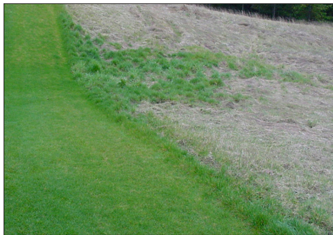
Figure 7: A buffer area allows nutrients in runoff to be taken up before reaching surface waters.

might otherwise reach waterways. Buffers also provide valuable food, cover, and travel corridors for some wildlife. Buffer widths as narrow as 15 feet have been shown to be effective in protecting water quality.