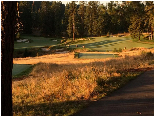
Figure 19. Native areas provide wildlife habitat and beautiful aesthetics.

Native areas can serve multiple functions on the golf course such as buffers near surface waters, wildlife habitat that provides forage and nesting sites for game and nongame species; and pollinator habitat (Figure 19). Establishing a native area can include plantings of grasses, forbs, and shrubs. Selection of species to be planted should be based on the site's climate, soils, intended use and planned management. Once established, native areas require little in the way of supplemental irrigation. The NRCS publication Five Keys to Successful Grass Seeding can provide additional information on species selection, seeding rates, and establishment. Figure 19. Native areas provide wildlife habitat and beautiful aesthetics.