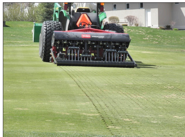
Figure 12. Deep-tine aeration.

Either hollow tines or solid tines may be used in deep-tine aeration; solid tines are often preferred when cultivating heavily compacted clay soils or gravelly soils for the first time. Cultivating with a conventional aerifier before using a deep-tine aerifier with solid tines may prove very beneficial. That’s because the aeration channels created by the conventional core aerifier receive some of the soil displaced by deep-tine, solid-tine aerification and lessen the disruption of the turfgrass surface with fewer plants lifted from the soil.